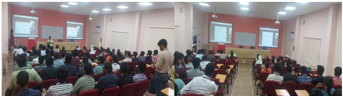
Participants: Students and Faculty